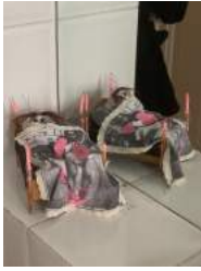
Heike-Karin Föll Untitled (art student) , 2020 C-Print Edition 1 of 3 + AP